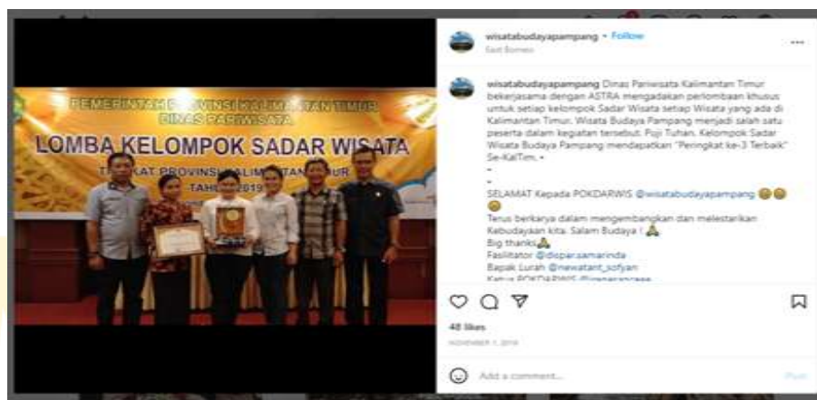
Figure 2. Pampang Village Achieves 3rd Best Ranking in East Kalimantan